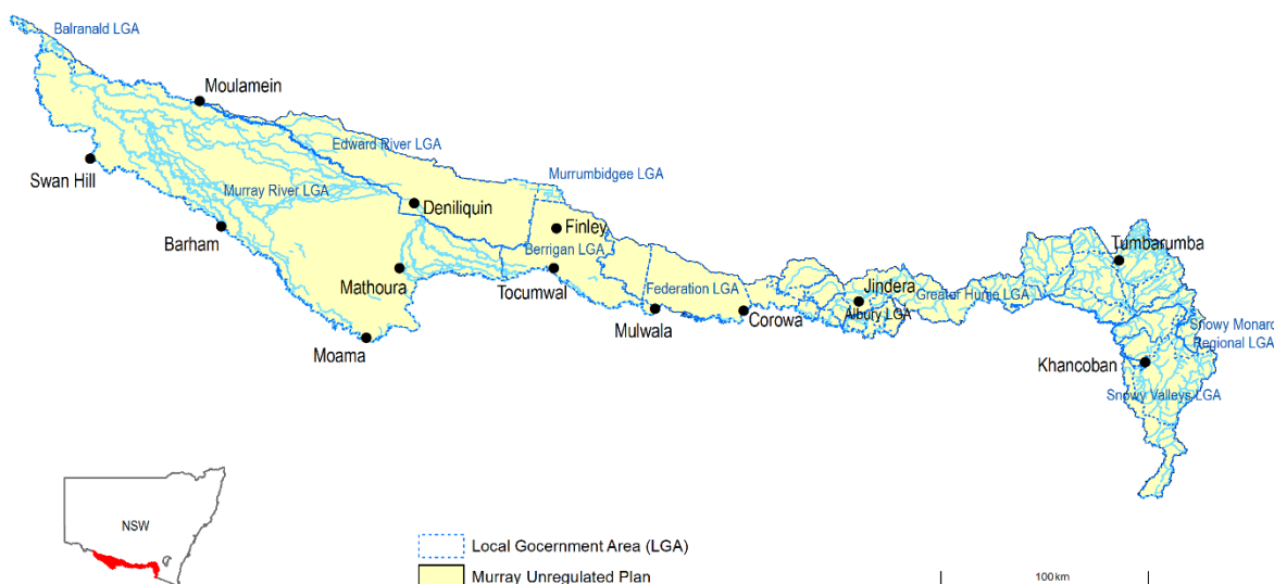
Figure 3: The Plan area including local government areas (LGAs)

Prior to 1 July 2020, the Plan also included the Murray Alluvial Groundwater Sources. However, the alluvial groundwater sources were separated into a separate water sharing plan (the Water Sharing Plan for the Murray Alluvial Groundwater Sources Order 2020 ) to align with the WRPs required under the Basin Plan.