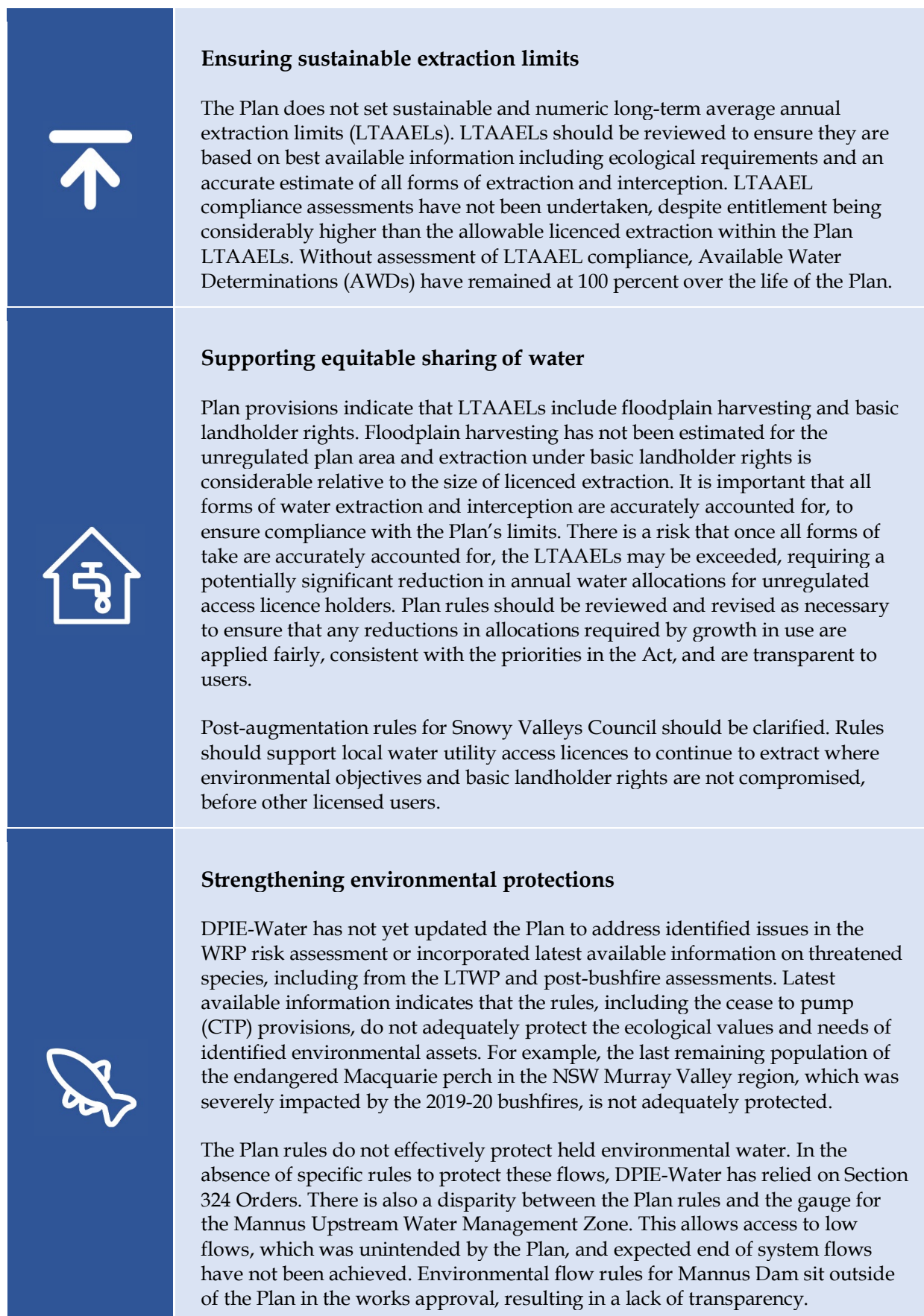
Figure 1: Key areas to improve Plan performance