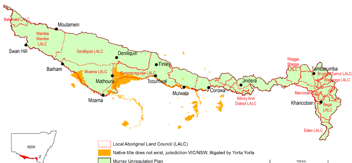
Figure 4: LALC and native title claim areas and determination areas for the Plan area

This process of values and uses mapping identified high cultural values and resources throughout the area; including burial grounds; oven mounds; scarred trees; story sites; stone artefacts; red gum trees; grasses and herbs – river mint, old man weed, flax lily, sedges for baskets, cumbungi for string; and food resource. 36 Yarkuwa has maintained a supporting process to enable the IPA transfer to take place, originally targeted for 2013. However, it has still not been declared an IPA (see further discussion in Chapter 6 ).